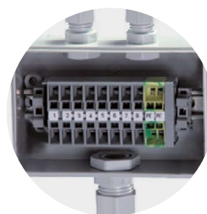
Optimised design for terminal blocks