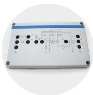
High-quality surface for printing