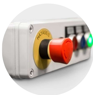
Designed for push-buttons