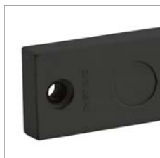
Also available in black.