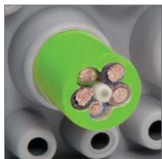
Conical shape on back provides additional sealing and strain relief