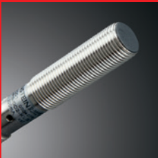
Sensor systems – Compact intelligence