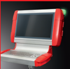
Enclosure systems – Function and design