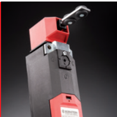
Switch systems – Economy meets safety