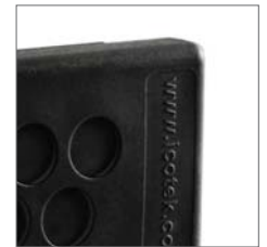
Also available in black.