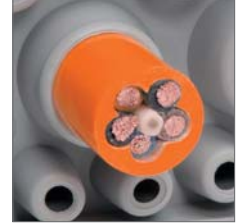
Conical shape on back provides additional sealing and strain relief