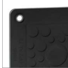
Also available in black.