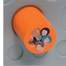
Membrane on front