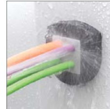
Certified protection class IP65/IP66/IP67/IP68